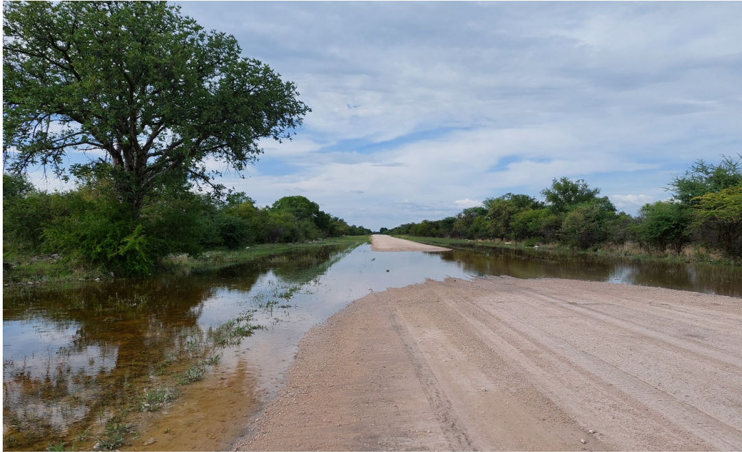
Water stoot oor 'n grondpad vroeër vanjaar in die Grootfontein-omgewing.

Gemiddelde tot bogemiddelde reën word tussen Desember en Februarie verwag. Warm tot bloedige warm weer word voorspel.