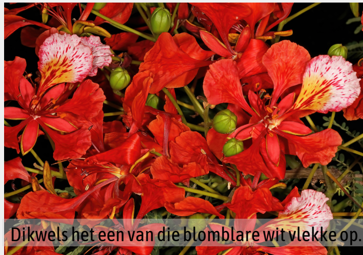
Dikwels het een van die blomblare wit vlekke op.

Dit is 'n gewilde kandidaat om bonsai-boompies van te maak en 'n flambojant-boom kan maklik ouer as 50 jaar word.