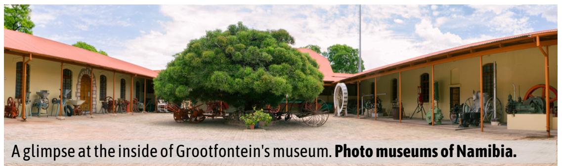
A glimpse at the inside of Grootfontein's museum.

Outjo Museum is situated in the Franke House, originally called the Kliphuis and one of Outjo's earliest buildings. It was constructed in 1899 by order of Major von Estorff as a residence for himself and subsequent German commanders. The focus of the museum is political and natural history. It can be visited on weekdays between 8:00 and 17:00.