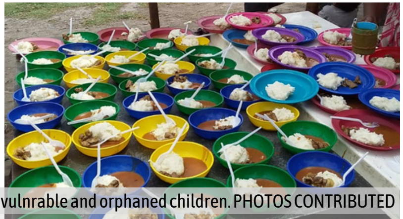
Elizabeth Petrus (in green) feeds Grootfontein's vulnerable and orphaned children.

"Anyone who can donate - even a bag of rice, maize meal, cooking oil or onions, please you are welcome.